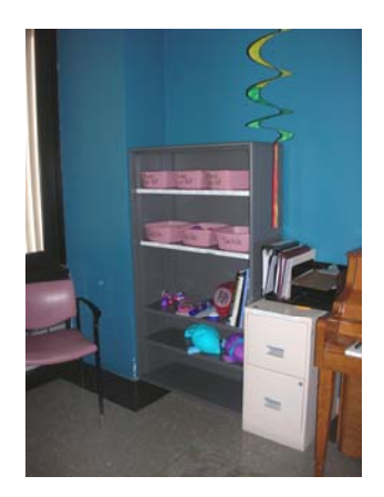
8-East UMASS Worcester