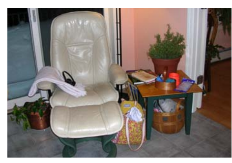
"Safe Space" in the home